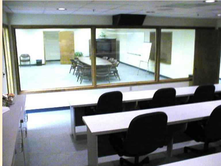
Focus Study – Viewed by customers, engineers, designers