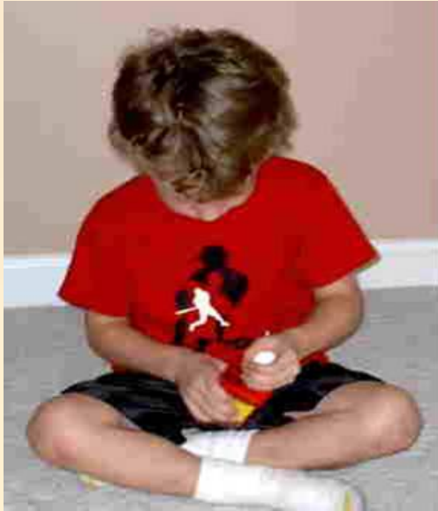
Protocol Testing – Child and Senior Tests